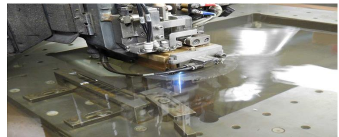
Fig.2: Experimental setup of a wire EDM [13].

Fitness function directs to the objective function which is required to optimize. Fitness function is also called as objective function which is the fundamental element of the genetic algorithm toolbox. Fitness function works on the principle of the “survival of the fittest”. This is the function that is to be minimize or maximize. The working of the genetic algorithm basically involves the gaining of the optimum solution from the given set of input data.